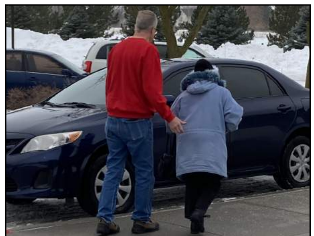
With a couple of icy days, the parking lot was a little hazardous for people who came to daily Mass. Even though the surfaces were salted, staff members still helped people walk back to their cars before and after Mass. Thank you staff!